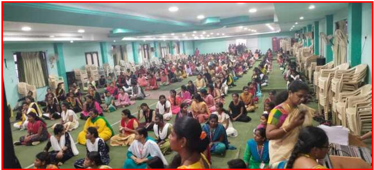
FEMVISTA'2021 – Fitness program