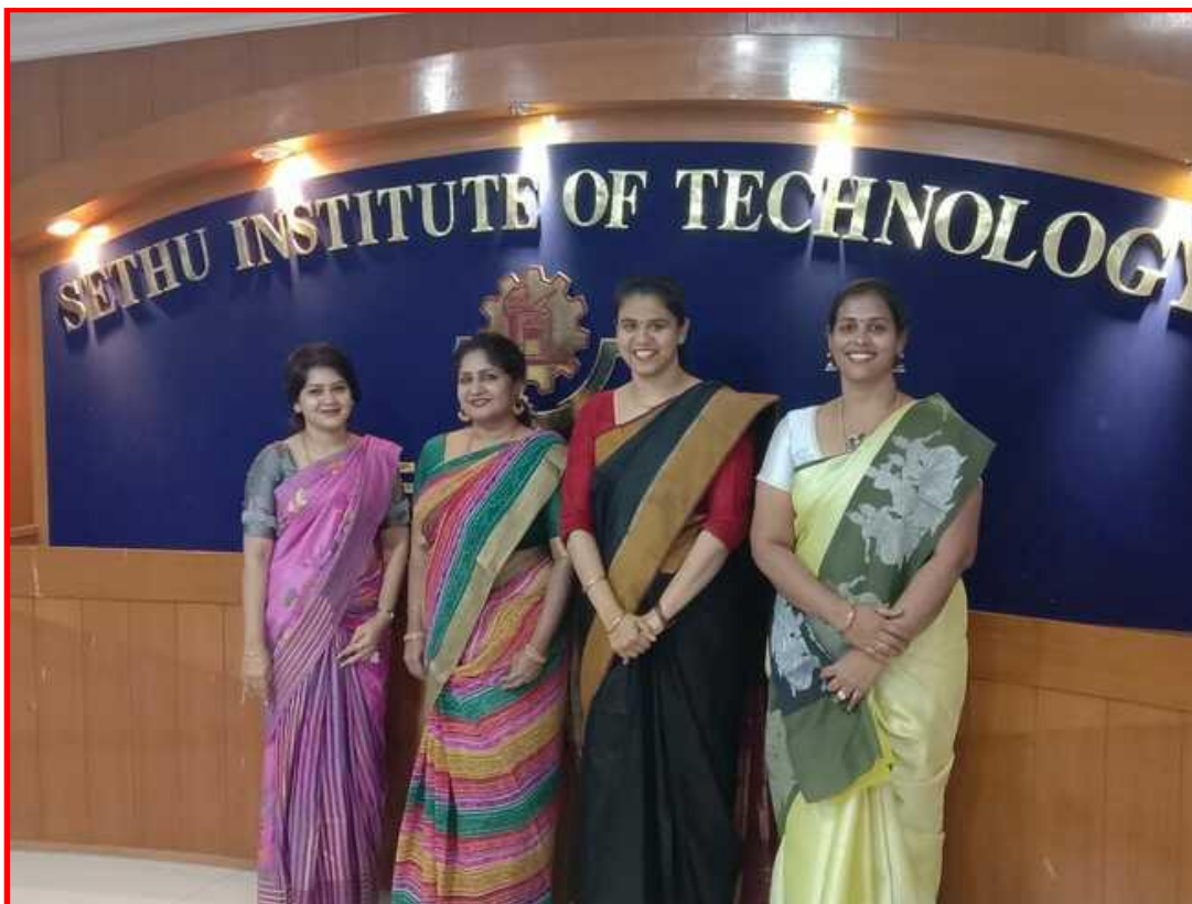
FEMVISTA'2021 Chief Guests

FITNESS & DANCE STUDIO Annamalai, Madurai